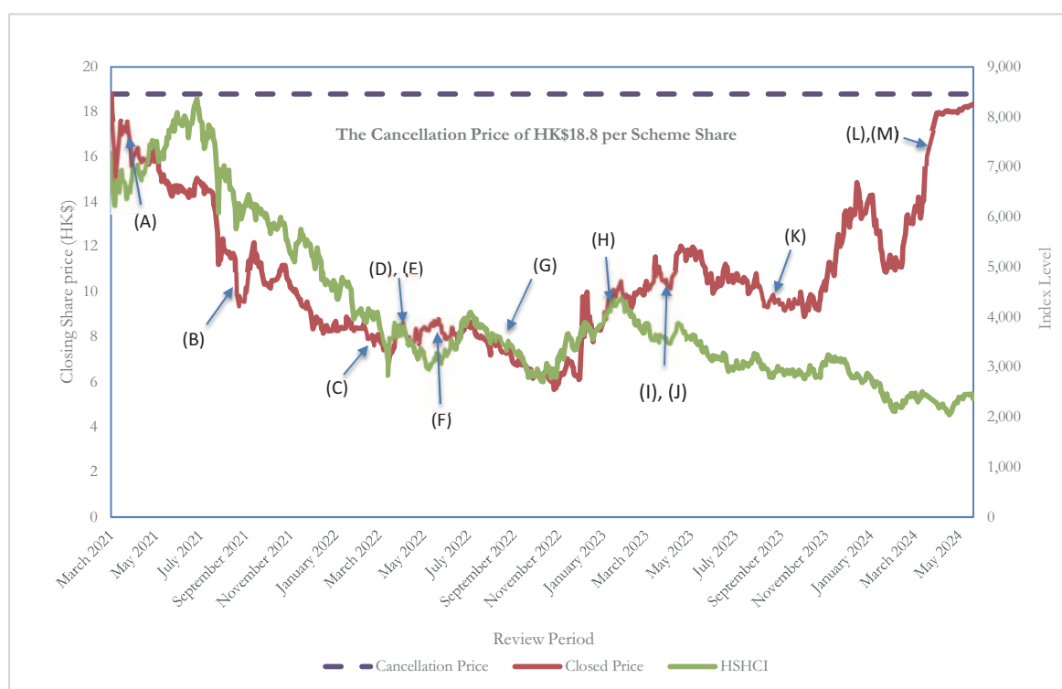
Chart 1: Relative historical price performance of the Shares and index movement of the HSHCI