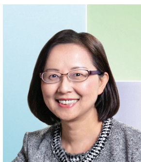
Agnes CHAN Sui-kuen BBS